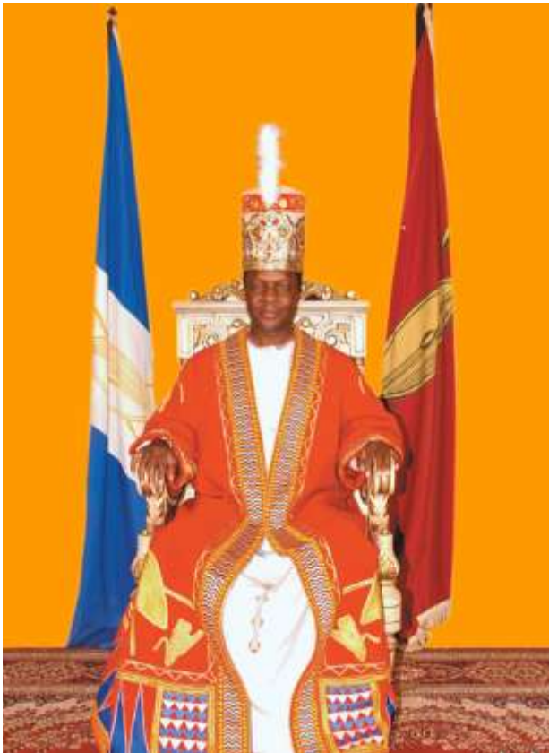
Ssabasajja Kabaka wa Buganda Ronald Muwenda Mutebi II