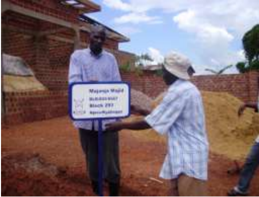
Omutuuze ng'akwasibwa akapande akalamba ekibanja kye mu Njeru Town Council e Kyaggwe.