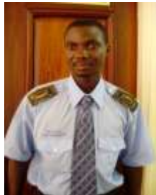
Ow'ebyobutebenkevu mu Bulange