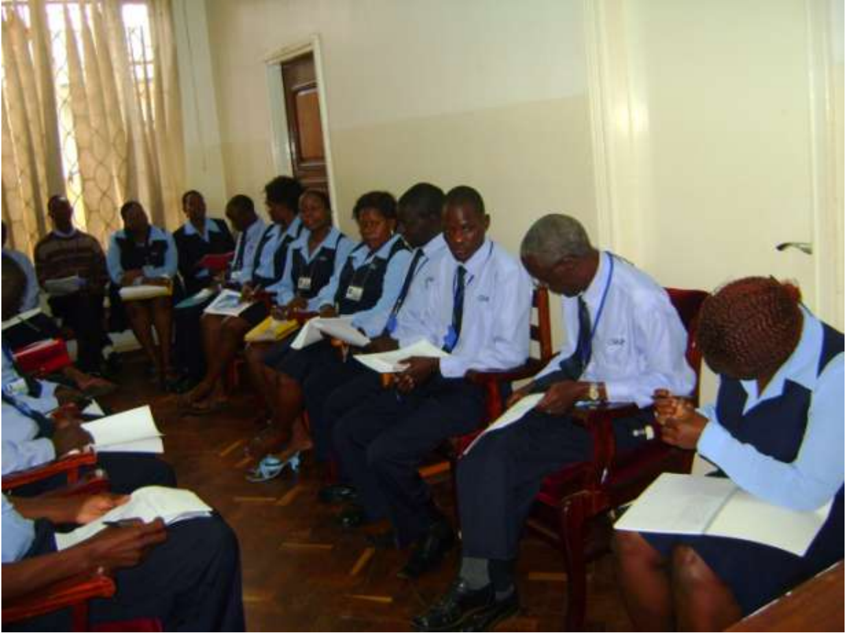
Abakozi ba Buganda Land Board nga bali mu lukiiko lwabwe (staff meeting)