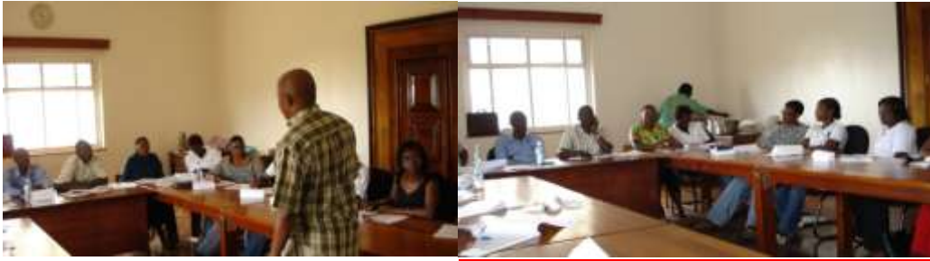
Abakozi mu Buganda Land Board nga bali mu gimu ku misomo egyabategekerwa

Mu nkola eyogeddwako waggulu, mwetuyise okubaako ne byetutuukiriza ebingi ddala omuli n'emirimu emitegekere mu biseera (Projects) nga bwegiragibwa wammanga ssaako n'ekigendererwa ekikulu ekyokussa ejjamba mu gwanika ly'obwakabaka gyetutuukirizza obweyamo bwaffe obw'ekiseera kyetumazeeko.