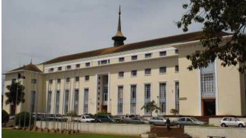
Ekizimbe Bulange nga bwekifaanana

Wofiisi ez'enjawulo eziri mu Bulange zitegekeddwa okulaba nga zimatiza obuwereza mu Gavumenti ya Ssabasajja Kabaka sso nga ziri ku mutindo ogutuukana n'emirimu egikolebwamu.