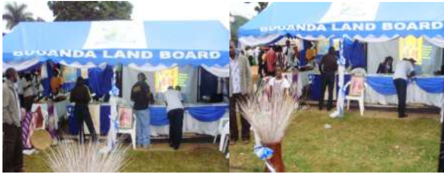
Omudaala gwa Buganda Land Board mu mwoleso e Lugogo.

Buganda Land Board yenyigira mu myoleso egitali gimu n'ekigendererwa eky'okutabagana n'abantu be tuweereza mungeri y'okuwanyisiganya ebirowoozo ate n'okufunayo amagezi amalala. Mu mwezi ogwa mukulukusa bitungotungo (October) omwaka guno 2009, twetaba mu mwoleso e Lugogo era omudaala gwaaffe gwaali mw'egyo egyasinga okulabika obulungi. Twafuna abagenyi bangi ddala omwaali ne Katikkiro wa Buganda. Abagenyi twasobola okubawereza obubaka ku masimu (sms) obusiima okutukyalira ssaako n'amagezi ge baatuwa kw'olwo.