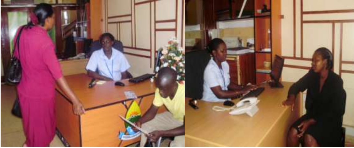
Ekifo mu Buganda Land Board awatuukirwa abagenyi