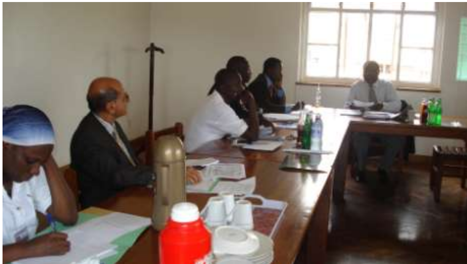
Akakiiko akavunanyizibwa ku kuteekateeka emirimu egikolerwa ku ttaka lya Ssabasajja Kabaka (Planning committee)