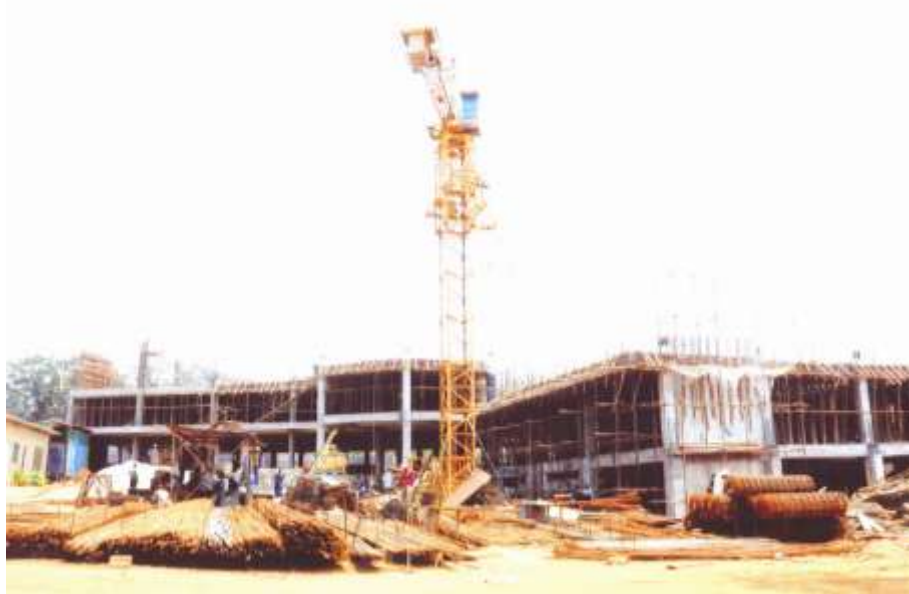
Ekizimbe Muganzirwazza e Katwe nga kyakasitulwa okuva mu musingi.