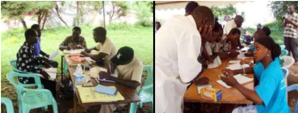
Abatuuze abe Njeru(Kyaggwe) ne Nansana (Kyaddondo) nga bawandiisa ebibanja mu Buganda Land Board

Mu mwezi gwa Ssebo aseka mu mwaka guno 2009, Buganda Land Board yatandika omulimu ogw'okuwandiika ebibanja byonna ku ttaka lya Ssabasajja Kabaka mu Ssaza Kyaddondo (bulooka 203) ne Kyaggwe (bulooka 293). Omulimu guno gugendereddwamu kukubiriza ab'ebibanja okunyweza obusenze bwabwe basobole n'okutongozebwa Nnanyini ttaka. Mu bitundu bye Nansana Town Council (Kyaddondo) ne Njeru Town Council e Kyaggwe abaayo bangi bamaze okuwandiisa ebibanja byabwe sso nga abatannaba bakubirizibwa okuwandiisa mu bujuvu. Omulimu guno okutandikira mu Town Council zino kyagendererwamu okukakasa enkola y'omulimu ogw'okumanya ab'ebibanja bonna abali ku ttaka lya Ssabasajja Kabaka.