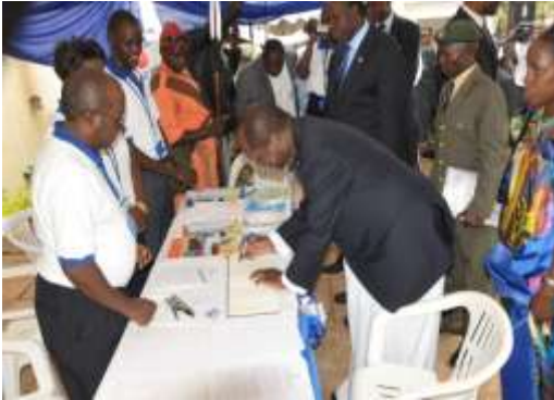
Ssabasajja Kabaka ng'awandiika mu kitabo ky'abagenyi ba Buganda Land Board. Yalambula omudaala gwa BLB mu mwoleso ogw'ebyobulambuzi ogwaali mu Bulange.