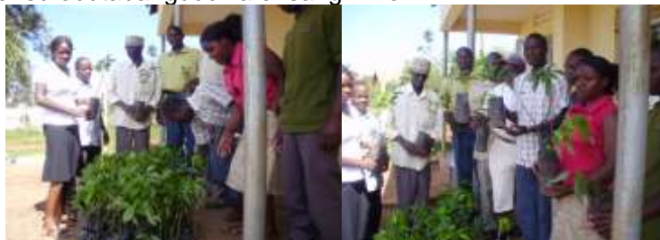
Abatuuze mu Nansana Town Council nga baakakwasibwa endokwa z'emiti okuva mu BLB.

Nga kawefube ow'okunyweeza abasenze ku ttaka lya Kabaka agenda mu maaso, Buganda Land Board egabidde ab'ebibanja endokwa z'emiti egy'embala mu nkola ey'okuddiza ku bantu ba Ssabasajja Kabaka. Bangi ku bamaze okuwandiisa ebibanja na ddala mu bitundu ebye Njeru ne Nansana baweereddwa endokwa z'emiti omuli emiyembe, avocado, emicungwa n'amapaapaali. Ekigendererwa kya kukungula ebibala ebinavaamu ejjamba n'okutumbula omutindo gw'obulamu naddala mu baana ssonga okusimba emiti nsonga yakukuuma butoned obutabanguddwa ensangi zino.