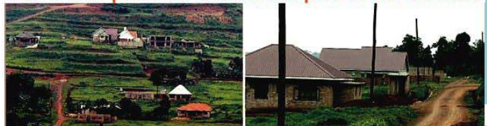
We cater for Middle and First Class clients