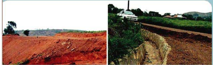
If you want to invest in Agricultural products, fertile land is available for leasing.