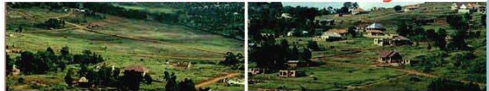
Get a well planned residential plot in our estates