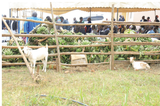
Amakula ga Beene