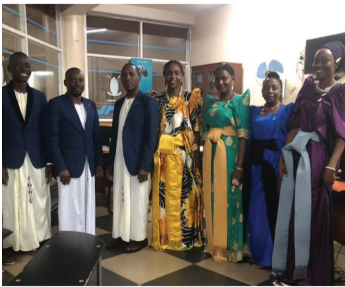
Abaweereza ba Kibuga