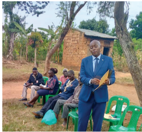
Gambobbi ng'annyonnyola obukulu bw'ebiwandiiko ku ttaka