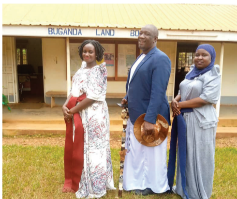
Ab'e Buddu bwe baalabise