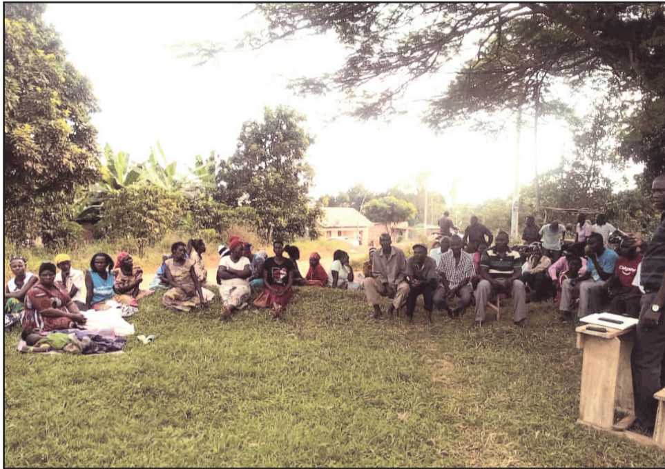
Maneja Kitooke ng'asomesa ab'e Nanyonga ne Namamonde