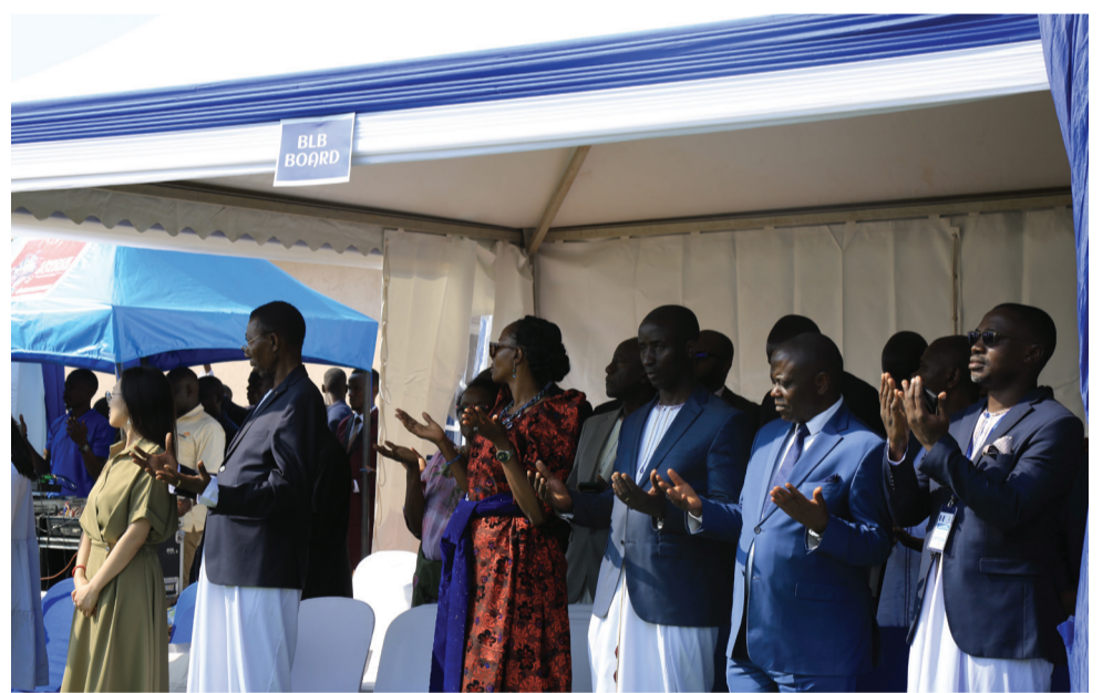
Abamu ku bammemba ba Bboodi ya BLB