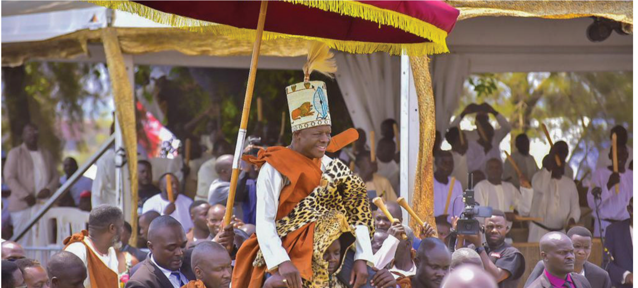
Ssaabasajja Kabaka ng'amulasa ku Mujaguzo ku matikkira mu lubiri e Mengo

Kyatokose si kisaanikire mu lubiri e Mengo, Ssaabasajja Kabaka Ronald Muwenda Mutebi II bwe yasiimye n'alabikako eri Obuganda okujaguza nga bwe giweze emyaka 30 bukyanga atuula ku Namulondo ya bajjajja be mu 1993, omwezi gwali gwa Kasambula nga 31.