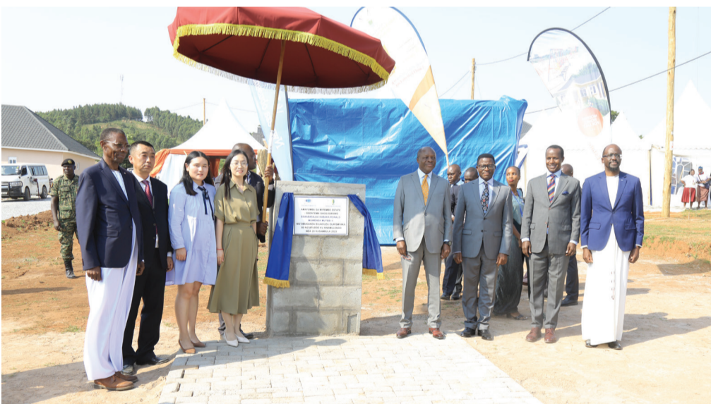
Ssaabasajja ng'atongoza awali ejjinja

BLB ye yawomye omutwe mu nteekateeka eno era Ssaabasajja yabasiimye byansusso wamu ne munnamukago wa Guoji okuzimba amayumba gano amateeketeke so nga era be bazimba amayumba aga babinojjo e Kigo.