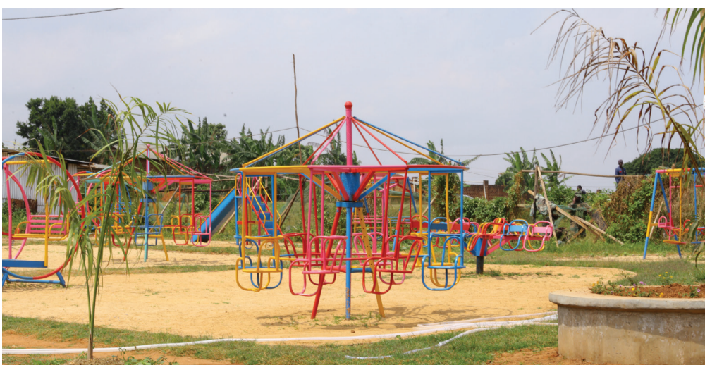
Ebifo awazanyirwa abaana ebiri mu kifo kino