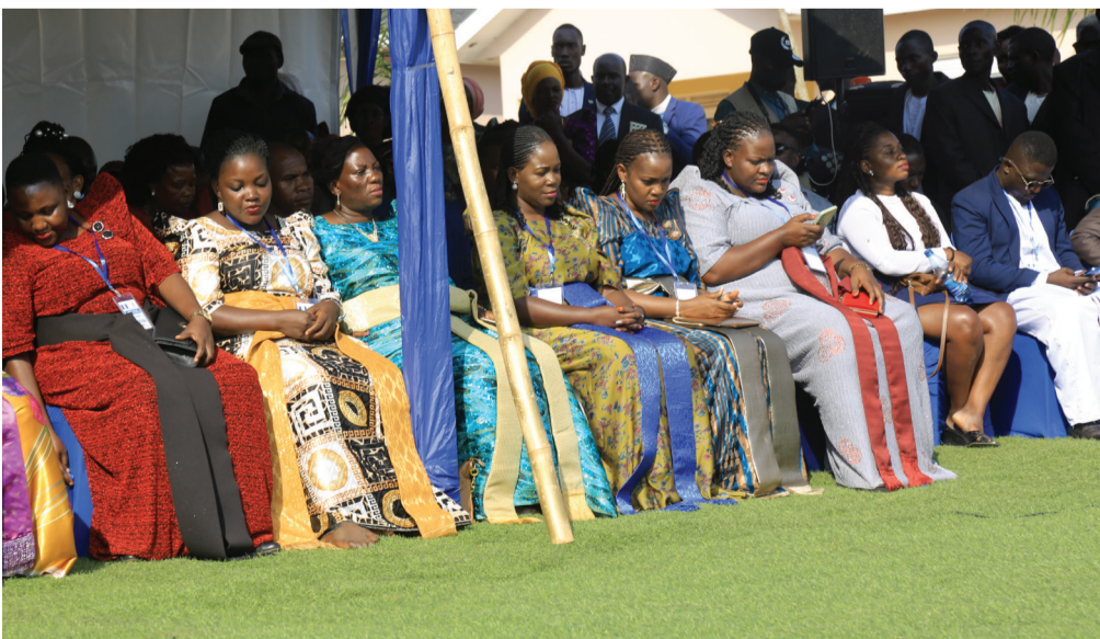
Abakozi ba BLB nga banekedde ku mukolo