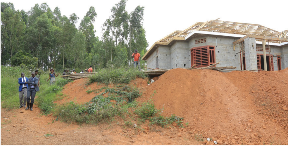
Ekimu ku bizimbe ebiteekeddwa mu Mayembegambogo