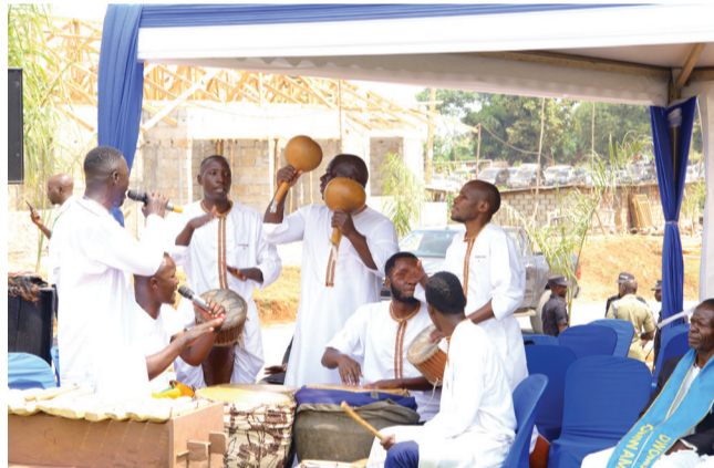
Abagoma nabo baasanyusizza Maasomoogi