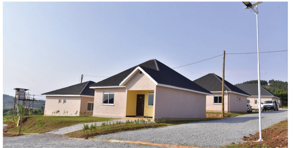
Amayumba ag'omulembe agazimbibwa