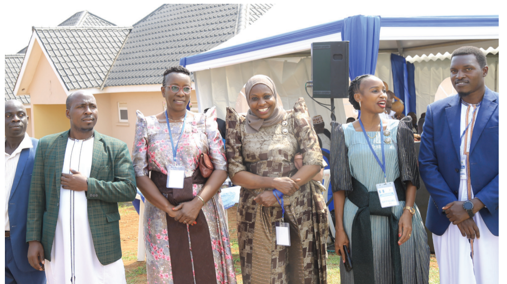
Abakozi ba BLB ku mukolo