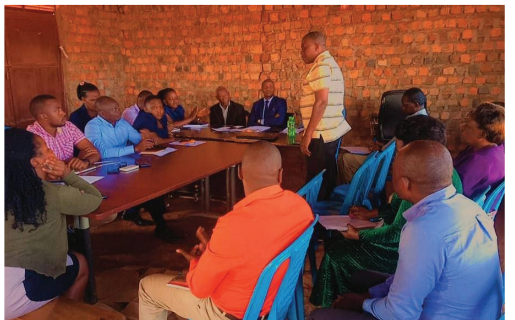
Omu ku Baami ba Kabaka nga yeeyanjula eri abaweereza ku ttabi e Nansana