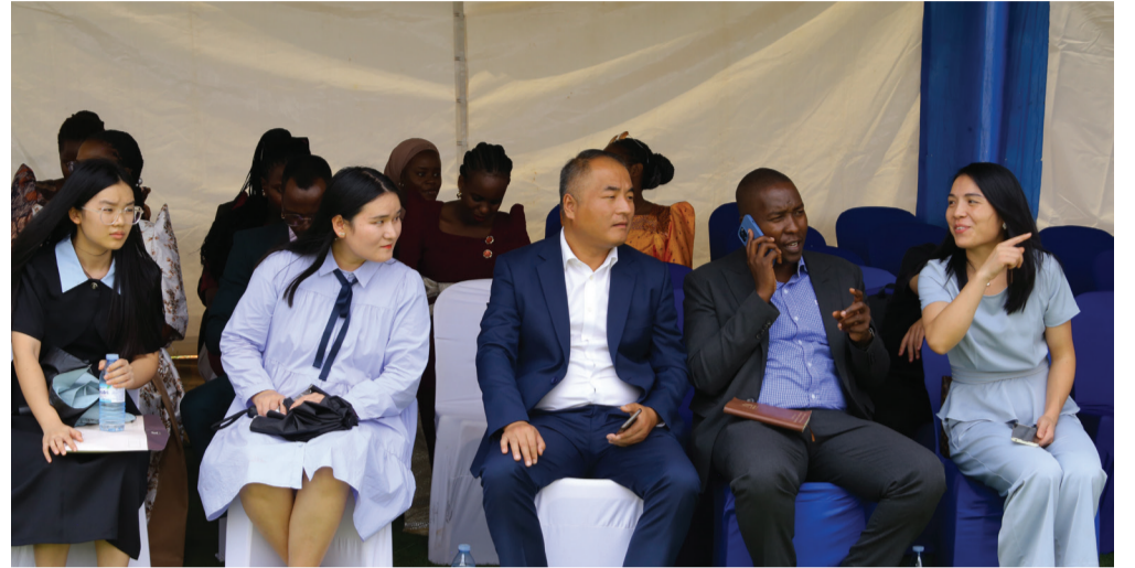
Bamusigansimbi aba Guoji Group ku mukolo e Ssentema

Kyabadde kijjobi Ssaabasajja Kabaka bwe yabadde asiimye okuggulawo amayumba ag'omulembe agazimbiddwa ku mbuga y'essaza Busiro e Ssentema.