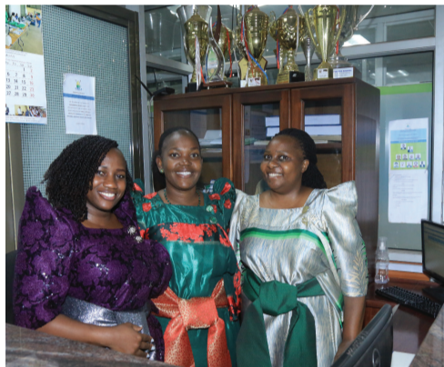
Abatuukirwako abagenyi ku kitebe bwe baalabise