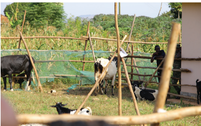
Ebisolo ebyatoneddwa eri Ssaabasajja