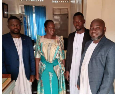
Ab'e Njeru nabo baawoomye