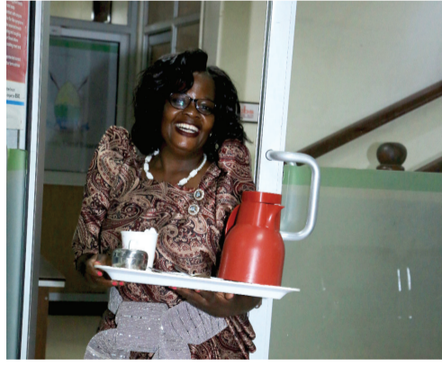
Nakaye kacaayi yaka gabulidde mu busuuti