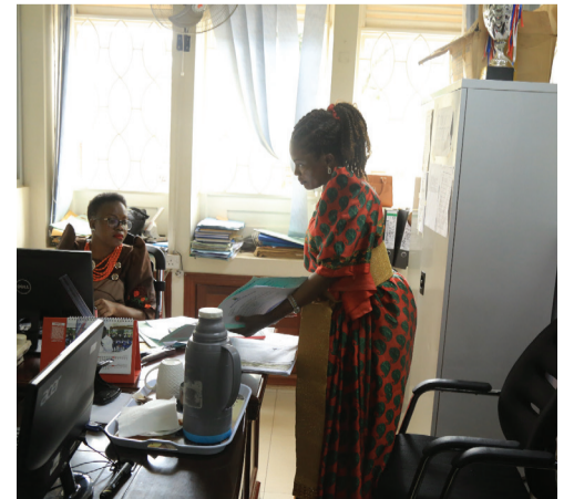
Omupunta Nabbanja naye kata ettaka alikubire mu busuuti. Namuli yabadde amuleettedde fayiro