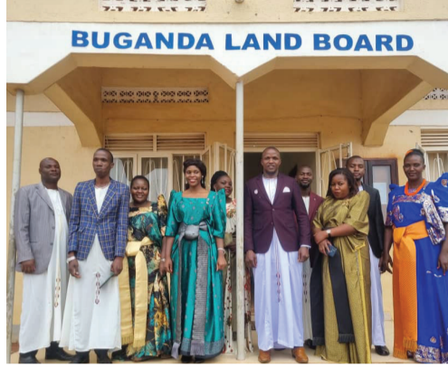
Ttiimu Nansana bwe yakiggunzew