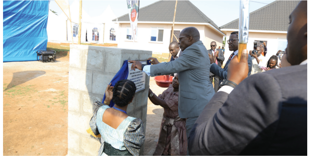
Ssaabasajja ng'atongoza awali ejjinja

Ssaabasajja Kabaka Ronald Muwenda Mutebi II yasiimye n'atongoza amayumba ga Mirembe Estate e Ssentema agaagendereddwamu okusobozesa abantu bamufunampola okufunako we babeera mu kifo ekiteeketeke.