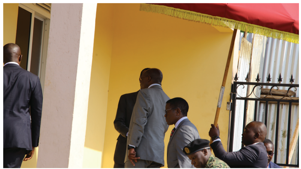
Ssaabasajja Kabaka ng'alambuzibwa amayumba