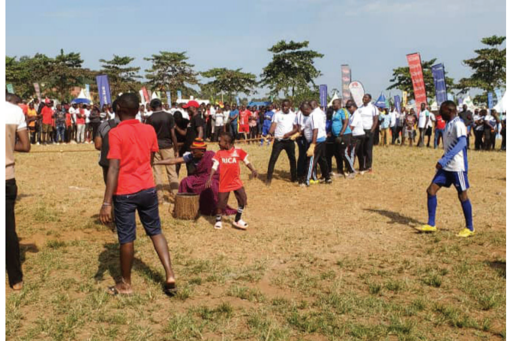
Muguwa nagwo gwasikiddwa