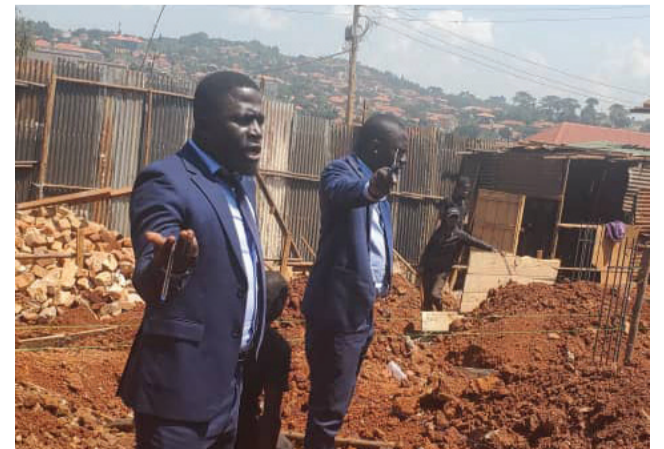
Ssejjengo ne Balaba nga bayimiriza abazimba mu kimpatiira