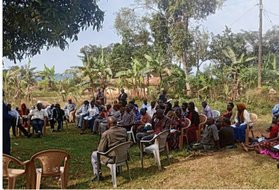
Bano batuuze ku ttaka lya Mut. I Mpiigi, nga bali mu musomo