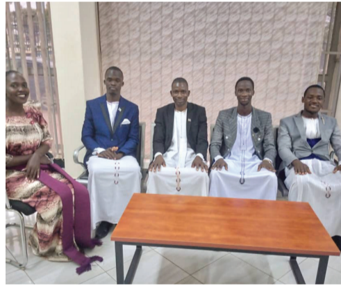
Abaweereza ba BULADDE SACCO