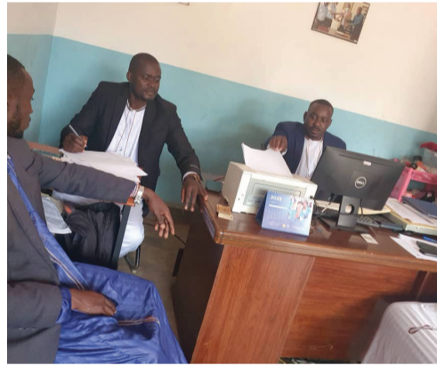
Ab'ettabi ly'e Luweero