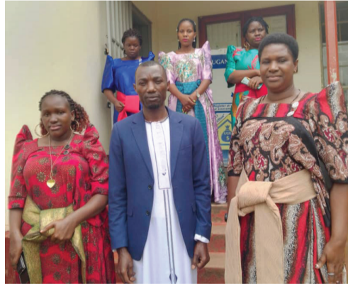
Ab'ettabi ly'e Kyaggwe - Mukono