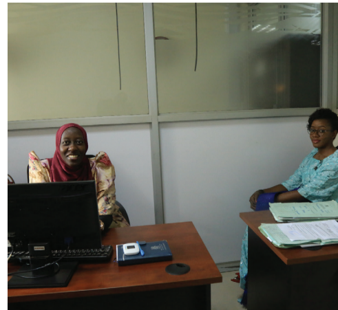
Ababalarizi b'ettaka nga baboobedde mu ofiisi yaabwe