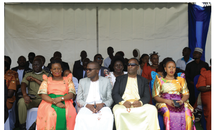
Abagenyi ba Ssaabasajja e Ssentema