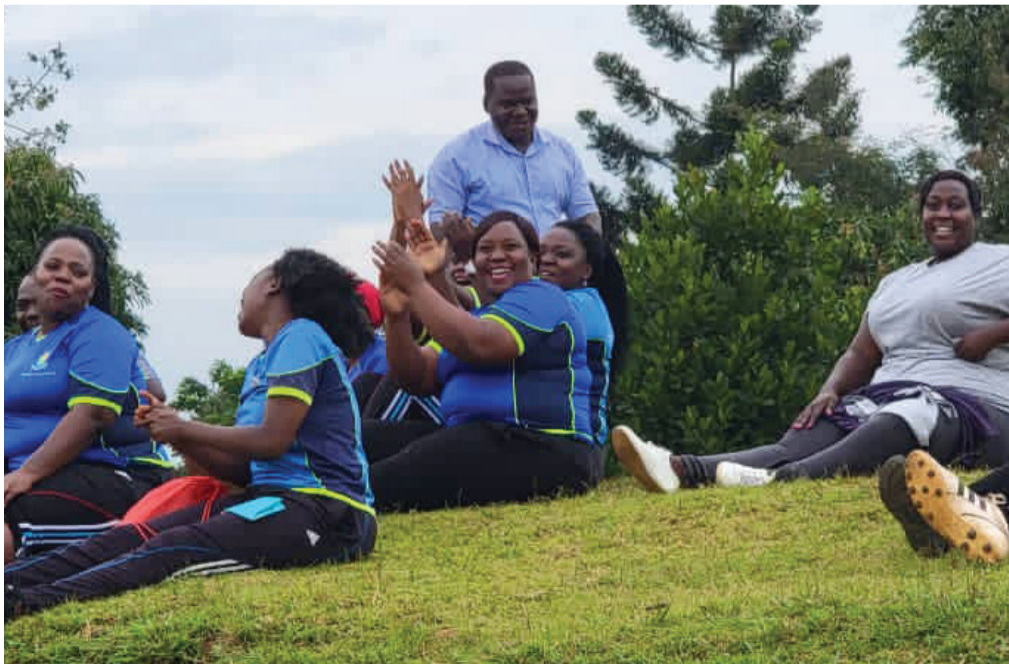
Abawagizi nga basaakaanya