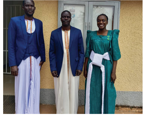
Ab'e Mpigi nga bananye