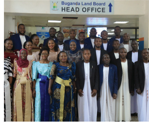
Abaweereza b'oku kitebe ekikulu ku Masengere