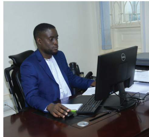
Kiyegga owa NTB ng'ane kedde mu kkanzu