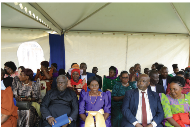
Abantu ba Ssaabasajja ku mukolo