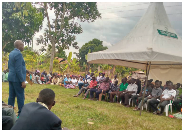
Gambobbi mu musomo e Buwe - Butoolo mu Mawokota