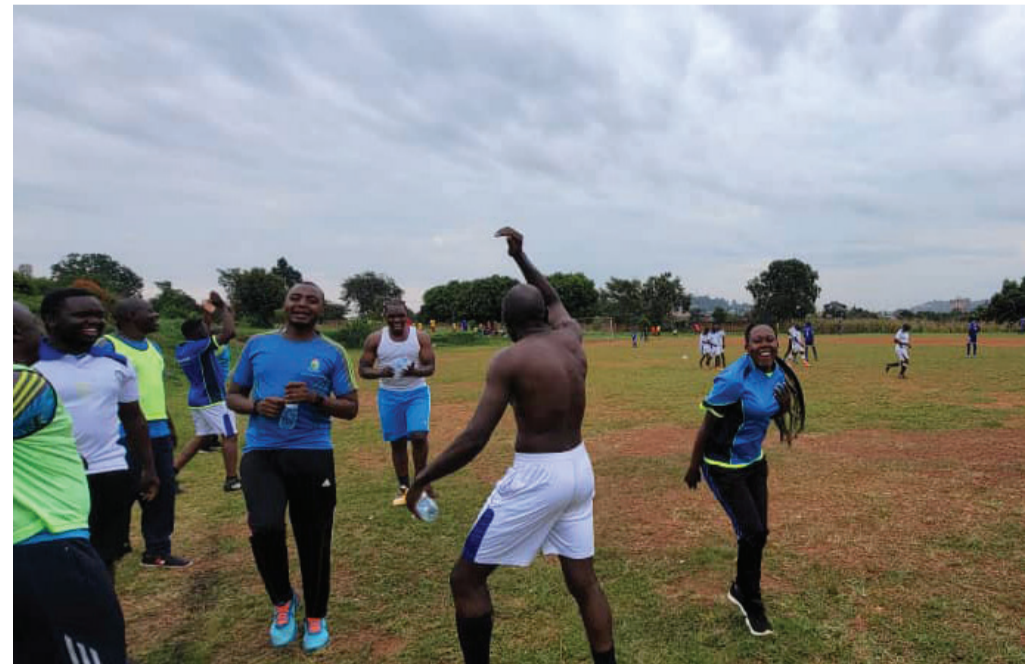
Abawagizi ba ttiimu ento nga bateebye esooka

Waabaddewo akabbinkano mu by'emizannyo gye buvuddeko, abavunaanyizibwa ku by'emizannyo bwe baategese ttiimu y'omupiira enkulu ey'ekitongole ekwatagane n'abasigadde. Kwabadde kunywa na kuwuuta ttiimu enkulu bwe yasoobereddwa n'eteebwa ggoolo mu kitundu ekyasoose. Wabula ttiimu enkulu mu kitundu ky'omuzannyo ekyokubiri yakomyewo ewaze n'eryoka ekomerera abaana baayo ggoolo eziwerera ddala 3, nabo ne bawanika nti omuzadde tasobya!