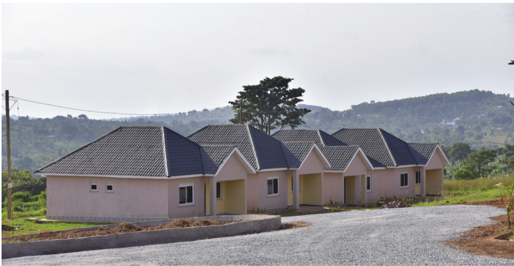
Amayumba ag'omulembe agazimbibwa

Ekirala ekyenjwulo kiri nti ennyumba zizimbiddwa mu kifo ekiteeketeke obulungi ng'omuntu alina ennyumba wano e Ssentema ajja kuba teyeetaaga kugenda Kampala kubanga buli kintu kigenda kubeerawo. Mugenda kubeeramu ebifo awawummulirwa, ssemaduuka, amasinzizo n'ebirala.