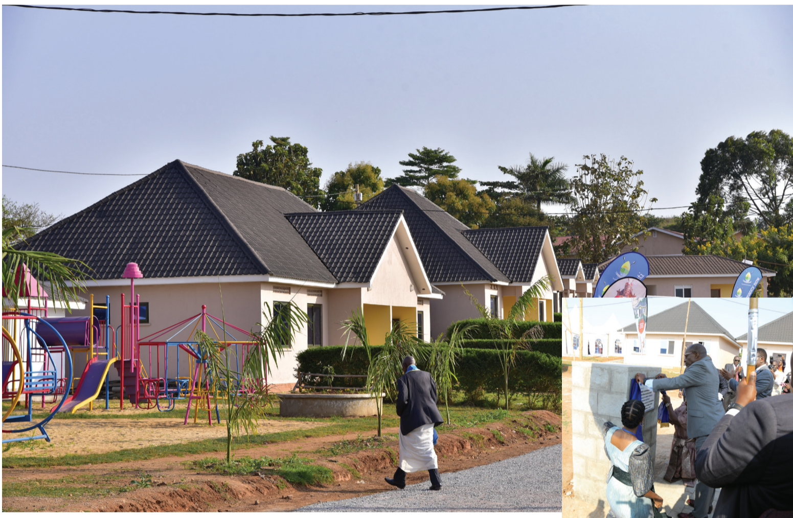
Ssaabasajja Kabaka mu kutongoza amayumba e Ssentema