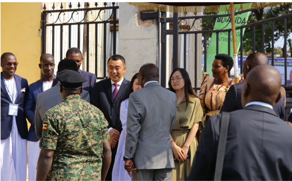
Ssaabasajja ng'alamusa ku Ssentebe ne Bassenkulu ba BLB

Ssaabasajja yakubirizza ebitongole ebirala ebya bamusigansimbi okukolera awamu n’Obwakabaka okutumbula embeera z’abantu mu nsonga ez’enjawulo.