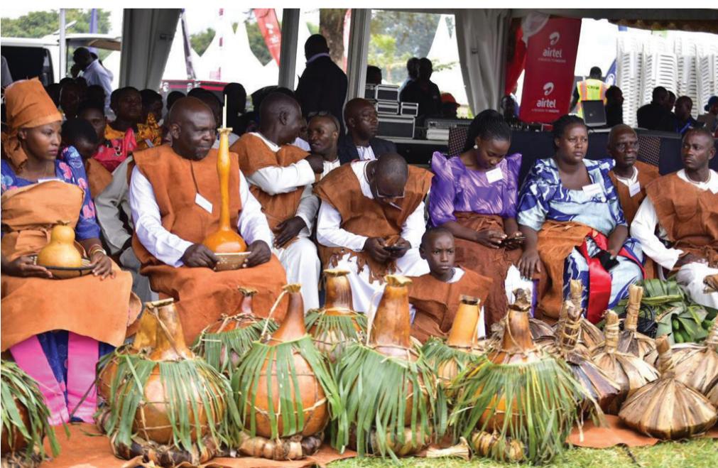
Sseruti n'ekibinja ky'abasenero ba Kabaka

Omukolo gwetabiddwako ebikonge ebyenjwulo okuva mu Bwakabaka ne gavumenti eya wakati ssaako mikwano gy'Obwakabaka egyetoolodde Obuganda.