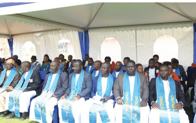
Abaami ba Kabaka ku mukolo e Ssentema