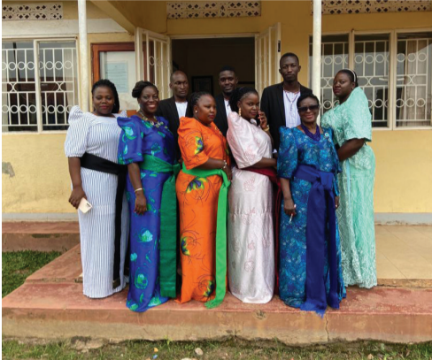
Tuutuno e Ndejje