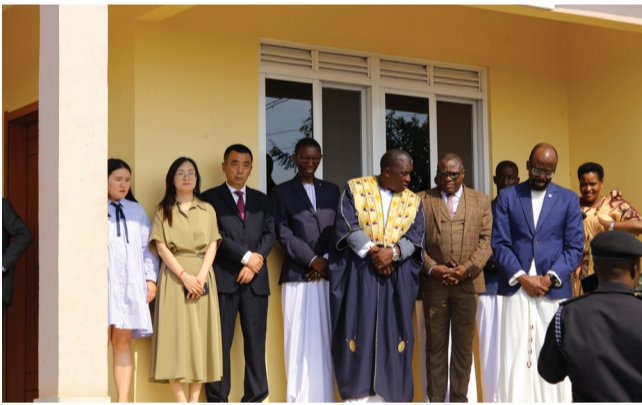
Abeekitiibwa ne bamusigansimbi mu kifaananyi ku nnyumba

Omukolo gwetabiddwako bannaddiini okwabadde District Khadhi w'e Wakiso n'abalala bangi.