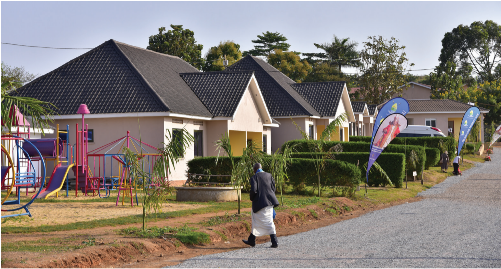
Amayumba nga bwegafaanana