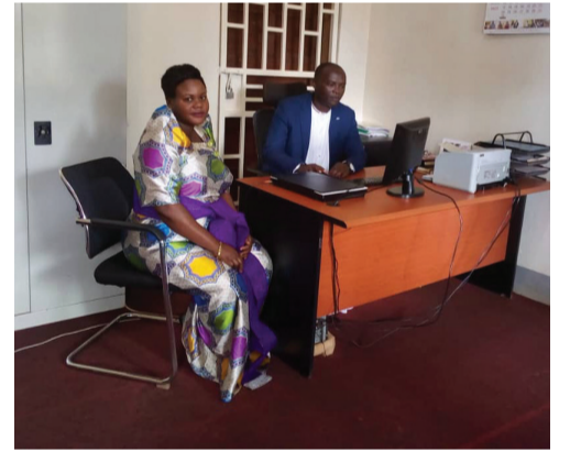
Ab'ettabi ly'e Mityana