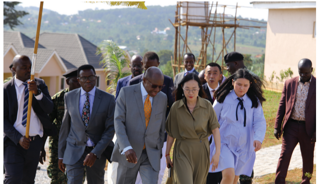
Ssaabasajja ng'aliko by'abuuzza Wendy owa Guoji wakati mu kumulambuza amayumba