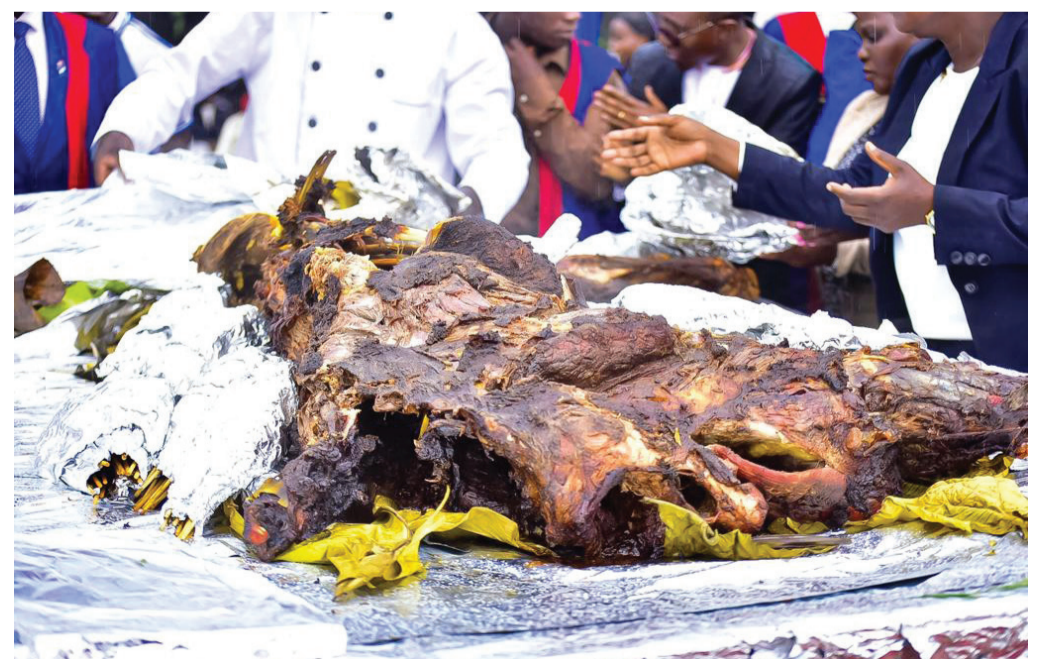
Ente eyagabuddwa ku mukolo gw'amatikkira