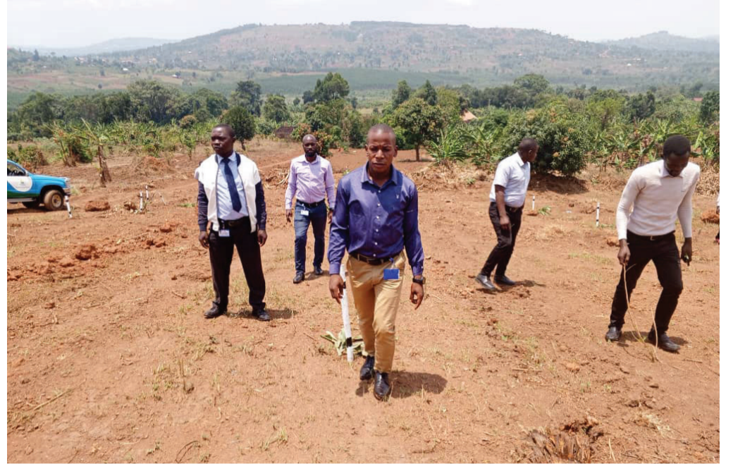
Mulema ng'akulembeddemu okuwenja bakiwagi abaasenze ettaka e Mayembegambogo Mpigi

Ab'ekikono ekikwasisa amateeka bakoze ebikwekweto ebyenjwulo naddala ebitangira abateeka enkulaakulana ku ttaka ly'Obwakabaka nga tebatuukirizza misoso gya nannyini ttaka. Bano baayimiriziddwa okukolerako era ne baweebwa amabaluwa, nga baabalagidde basooke beeyanjule ku ofisi ezitwala ebitundu ebyo.