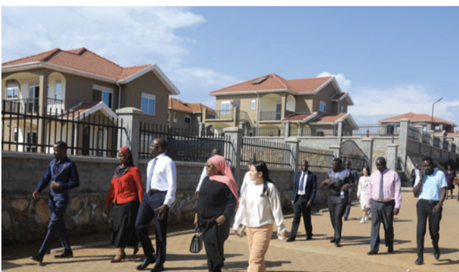
Bammemba abapya nga balambula pulojekiti ya Mirembe Villas e Kigo