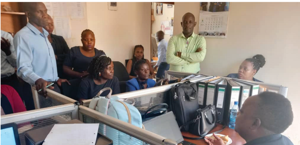
Aba ttiimu Ndeje nabo yabatuuseeko n'enjiri ya bakasitoma okukyallira amatabi enaatera okuggyibwako akawuuwo