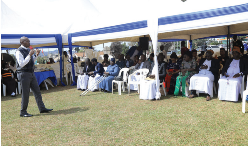
Gambobbi ng'asomesa abaakiise okuva e Gomba mu luwalo mu bimuli bya Bulange