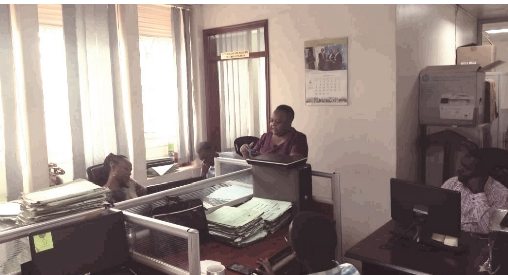
Namaganda ng'abangula abaweereza