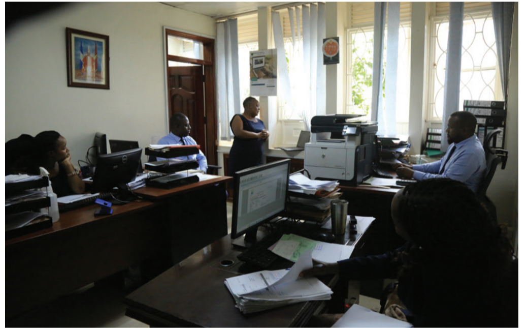
Namaganda n'abekikono ky'obyensimbi yababangudde