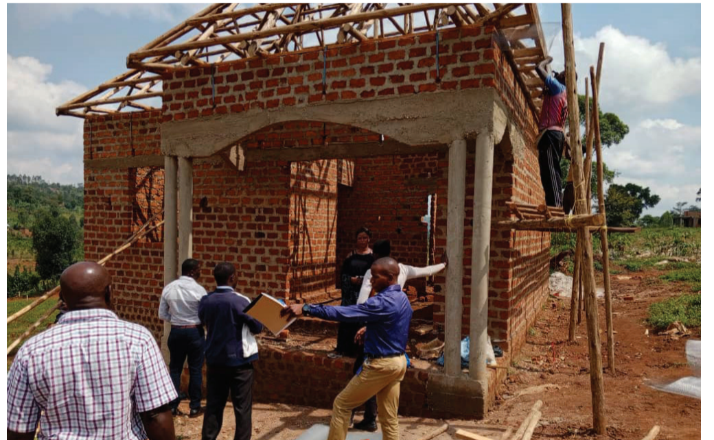
Baabano nga bayimiriza eyazimbye mu kimpatiira e Mayembegambogo