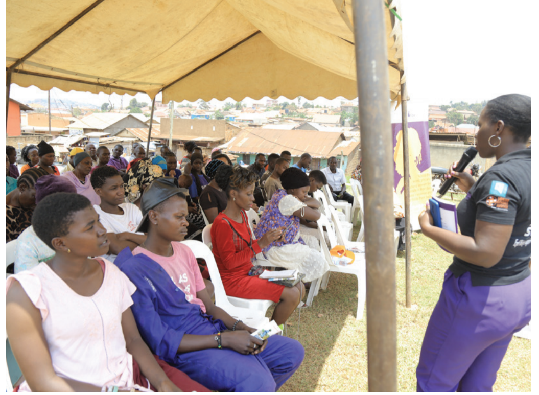
Munnamateeka okuva mu Fida ng'ayogerako eri abantu ku ddembe lyabwe ku ttaka n'amaka

Omusomo gwayindidde mu zooni ya Nabukalu mu muluka