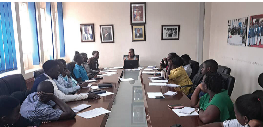
Omumbejja Ndagire ng'ababangula ku by'okuteekateeka fayiro za bakasitoma nga zekkaanyiziddwa abateekateekera ettaka