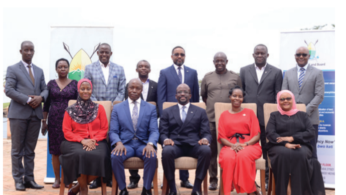
Olukiiko olupya olwa Bboodi