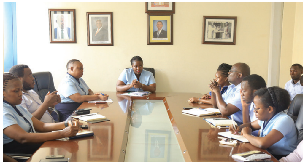
Namaganda ng'ayogerako eri ab'ekiwayi ekiteekateekera ettaka, okupunta n'okubalirira ettaka