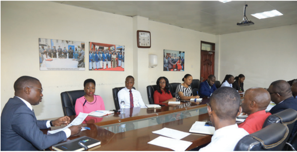
Omuk. Hajji Kizito ng'asisinkanye bannamateeka, liizi n'okuzimba bizinensi