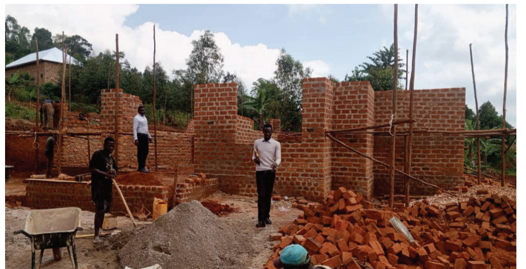
Ekimu ku bizimbe ebitutunuka mu kimpatiira e Mpigi