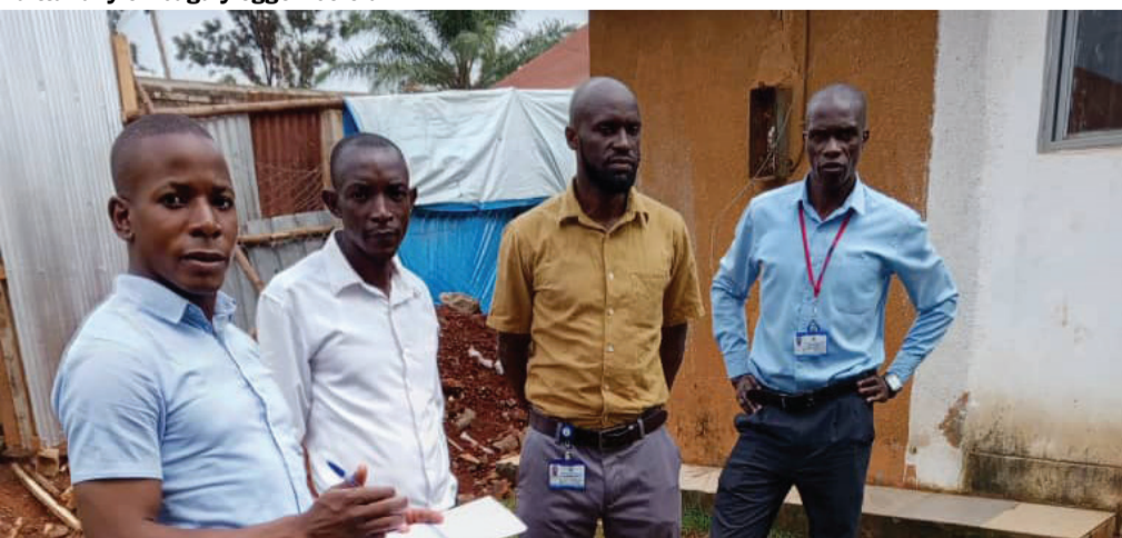
Mulema ng'abaga ekiwandiko ekiyimiriza ebikolebwa mu bukyamu e Kitale