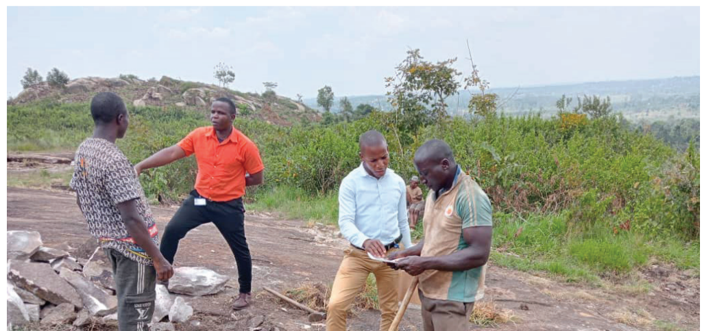
N'abasima amayinja e Namamonde baabayimiriza n'ekiwandiko