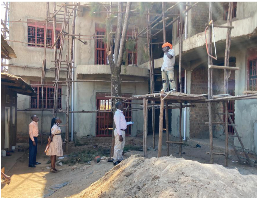
Ebizimbe ebipya tebyataliziddwa

Ab'ettabi ly'e Ndejje beekozeemu omulimu mu kawee-fube gwe baliko okulaba nga badda engulu mu by'ennyingiza 'ensimbi. Bano beekozeemu ebibinja babyesigameko okulondoola n'okuffetta