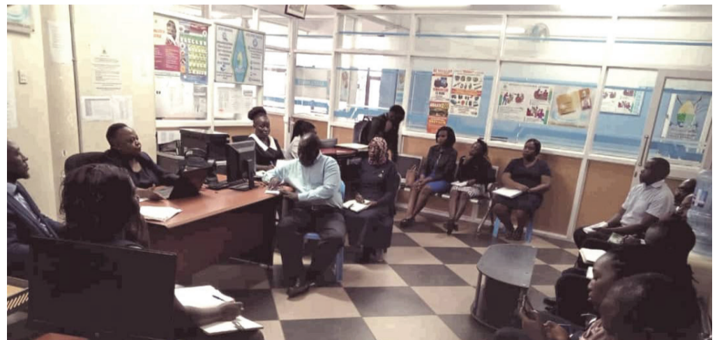
Namaganda ab'ettabi lya Kibuga yabakedde mu bunyonyi okubabangula