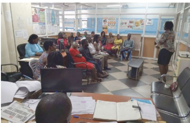
HRO Nalule mu lukiiko Iwa Kibuga oluggalawo omwezi