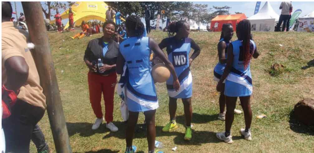
Tiimu y'okubaka nantawunyikamu okuva mu BLB

Okuvaako mu mpaka z'ebitongole ebinene, BLB yagudde maliri n'ekitongole ki Cipla buli omu bwe yateebye ggoolo emu mu katimba ka munne mu luzannya lwayo olwasoose.