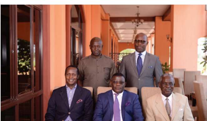
Abayima ba Ssaabasajja Kabaka