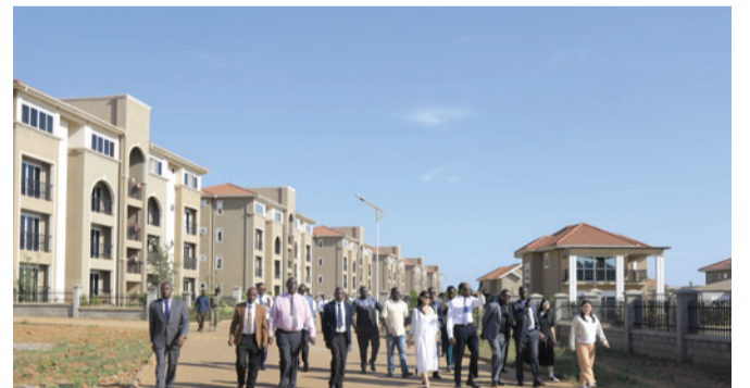
Okulambula nga kugenda mu maaso