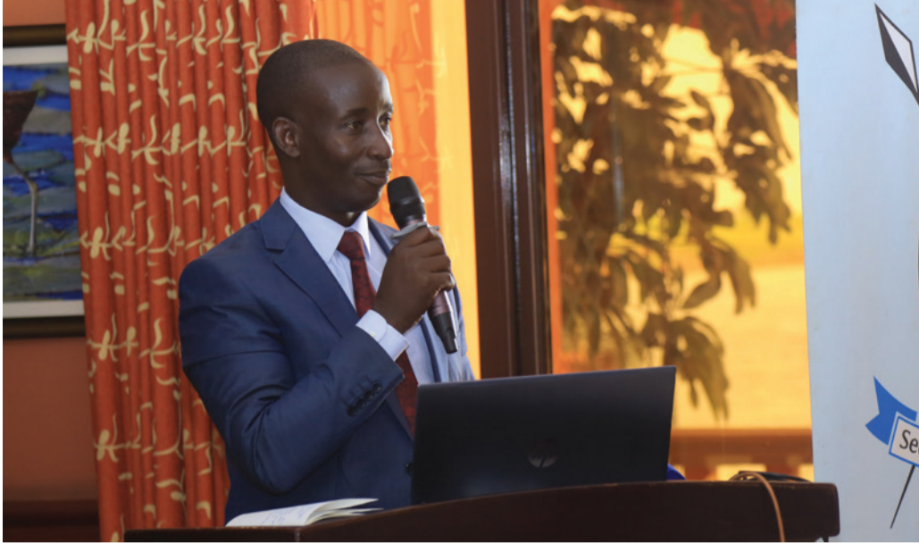
Ssenkulu Kabogoza ng'awa ebyafaayo bya BLB eri bammemba mu kubabangula