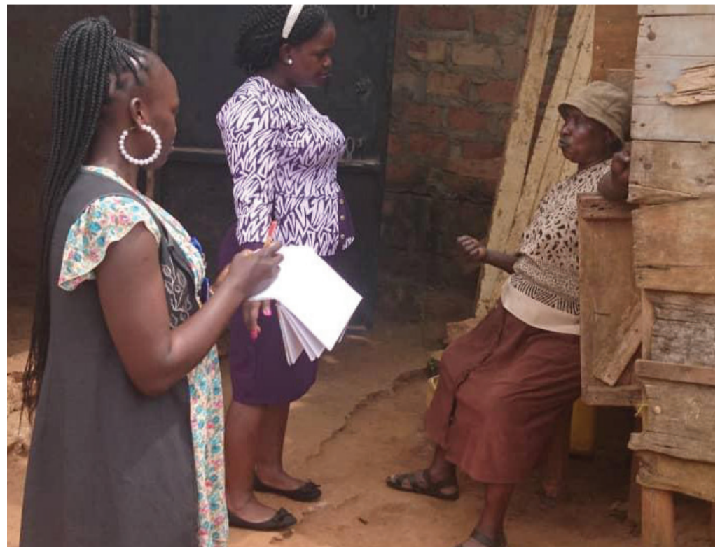
Bano baagenze nju ku nju

Baakoze ebibinja okuli; Fantastic, Supersars ne Greatness, nga bino bakuffetta nju ku nju olwo zidde okunywa. Bano baluubirira